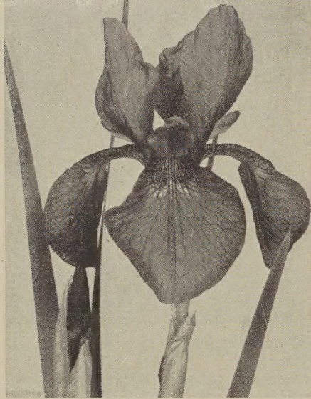
SIBERIAN IRIS, PERRY'S BLUE